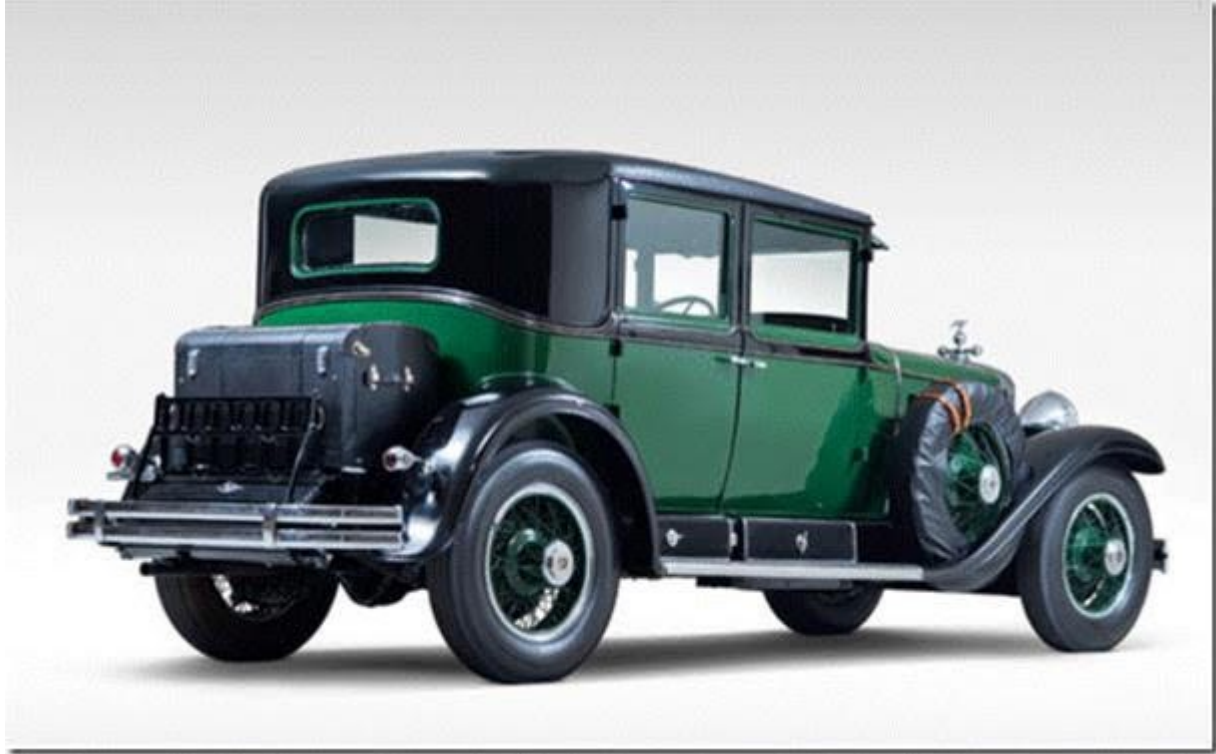
It also had a specially installed siren and flashing lights hidden behind the grille, along with a police scanner radio.